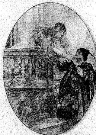
The story of Romeo and Juliet's ill-fated love has captivated audiences for centuries.

Select the boldface word that better completes each sentence. You might refer to the passage on pages 88–89 to see how most of these words are used in context.